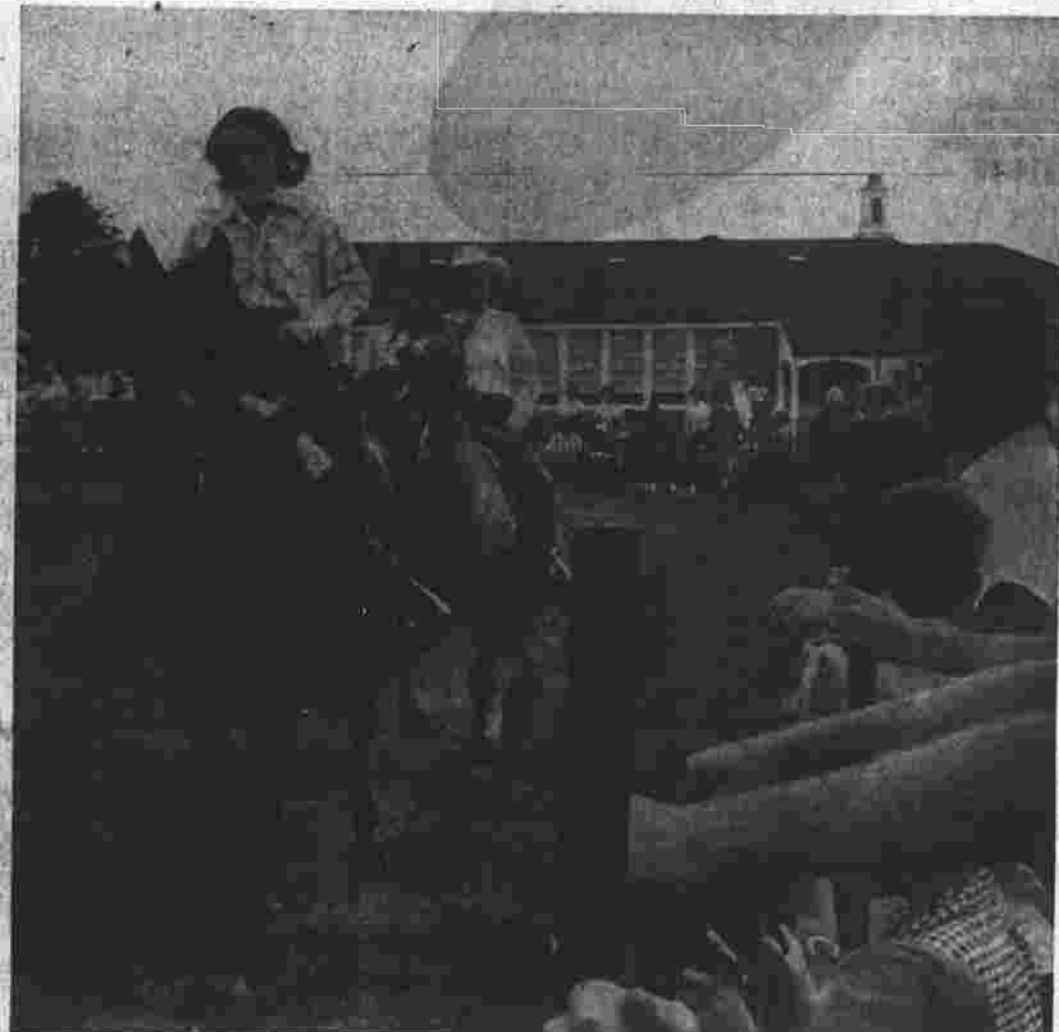
4-H Mountain Riders demonstrate riding skills for crowd of onlookers.