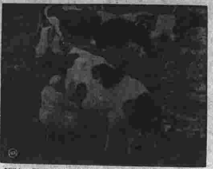
Milking Time in Russia: They milk everything they've got

Giving the Russians the advantage, it's estimated that their cows yield between 3,000 and 3,500 pounds per year.